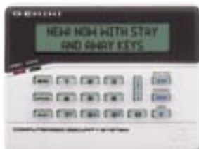
GEMK1CA 4 built in zones

Compatible with these standard Gemini keypads