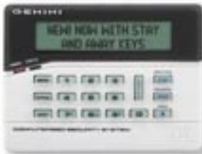
GEMK1CA 4 built in zones