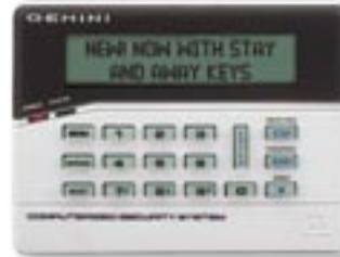
GEM-K1CA 4 built-in zones

Compatible with these standard Gemini keypads