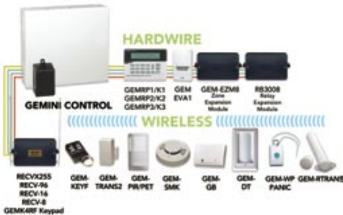
Gemini keypads compatible with the GEMP9600

Gemini P9600 powerful multi-tasking hybrid control panel – feature-rich for security applications and home automation integration.