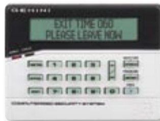
GEM-RP1CAe2 4 built-in zones