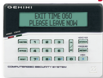
RP1CAe2 4 built in zones