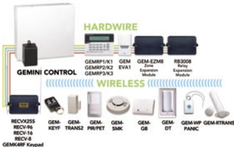
Gemini keypads compatible with the GEMP3200

NAPCO's Gemini™ GEM-P3200 a popular, all-around 8 zone hybrid control expandable to 32 zones or 48 wireless points.