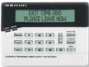
RP1CAe2 4 built in zones