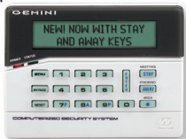
GEMK1CA 4 built in zones

Compatible with these standard Gemini keypads