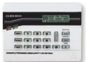
GEM-K4/K4RF with RF receiver