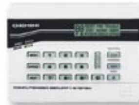
GEMK4/K4RF Built in RF Receiver