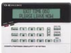
RP1CAe2 4 built in zones